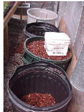
Washing Coconut Husk Chips

To prepare the husk we first hydrate the bale in two 32 gallon containers at least overnight , and then transfer the hydrated husk and excess water to a second container that has had a large number of holes drilled into the bottom, and about six inches up the sides. After the husk drains, a steady stream of water is washed through until it appears to run clear from the container. Then the husk is again transferred back to the solid container and again covered with water with a few ounces each of Calcium Nitrate and Magnesium Sulfate (Epsom Salts) added at least overnight. The draining and washing procedure is repeated again using pure water, with the final rinse being extensive. At this point