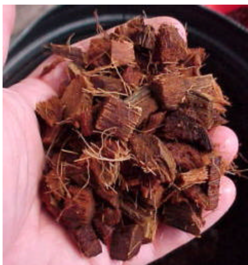
Hydrated Medium Coconut Husk Chips

The second was coconut husk chips. While holding approximately the same level of air immediately after watering and as it dried out over a 5-day period in 2.5-inch rose pots; it also held substantially more water. After six months under greenhouse conditions, fine fir bark had broken down and dramatically lost its air holding capacity and stayed quite soggy, while the small coconut husk performed essentially as it did when new. We'll discuss some quantitative aspects of coconut husk chips later in this article, but first lets discuss its preparation, use, and some of our qualitative observations.