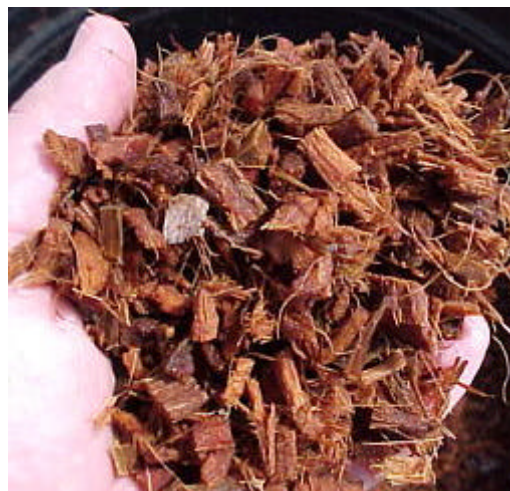
Hydrated Small Coconut Husk Chips

Two medium components did defy logic and have the capacity to hold large amounts of air and water simultaneously. The first is New Zealand sphagnum moss used alone. NZ sphagnum will simultaneously hold more water and more air than almost any other potting medium commonly available if kept loosely packed, but therein is one problem: overpack it or allow it to pack itself overtime and it holds way too much water and too little air. NZ moss does have some drawbacks: it is also hard to stabilize a plant in its pot with a loose pack of moss, it is hard to rewet if allowed to completely dry out, and does break down fairly rapidly if kept moist, so for some folks its a wonder medium, for most it's not very practical. It is also a very acidic medium, and retains this property for a long period in spite of heavy watering. When it loses this acidity is when it breaks down very rapidly. Our experience is that it is a very good medium for temporary root recovery culture (particularly live sphagnum moss) of the acid substrate Paphiopedilums, but we have not found it to be particularly good for long term culture.