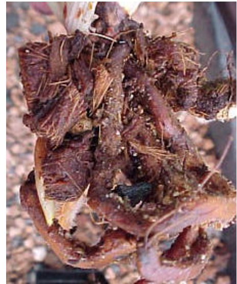
Newly Emerging Roots Adhering to the Coconut Husk Chips Just a Few Weeks After Repotting

When we first started experimenting with coconut husk chip mix on some plants, we would unpot a portion of them every week to inspect the roots. We were impressed at both the speed of initiation and the number and substance of new roots on the plants that had been switched. We continue to see this, and have been working to switch all plants, from seedlings to stud plants, over as quickly as possible to this new mix. We have repotted several plants that had lost all of their roots while in our standard bark mix and were "circling the drain" into coconut husk chip medium and have watched them revive and initiate new roots faster than we would have believed possible for a Paph to respond to such improved conditions. A few plants that we feel would have otherwise have certainly died due to their poor root health have been revived using this new mix. We have also seen a similar pattern in our Phrags. While it is much easier to maintain good root systems on Phrags than Paphs, our Phrags seem to have immediately picked up when put in