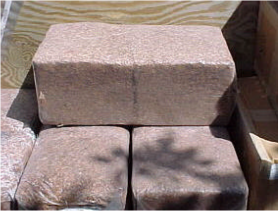
Compressed Bales of Coconut Husk Chips

The other major problem associated with bark mixes is their rapid break down. The fine bark mixes are especially prone to this, with noticeable deterioration (with resultant loss of aeration and increase in drying time) in as little as 3 months, and significant deterioration within 6 months under our culture conditions. For a very small collection this is resolvable by very frequent repotting, but in a larger collection this is not feasible. And with the weather conditions found in the Northeastern US where we are located, especially in the winter, we need to maintain a freely draining mix that dries within a few days, when there is less sunlight and somewhat cooler temperatures in the greenhouse.