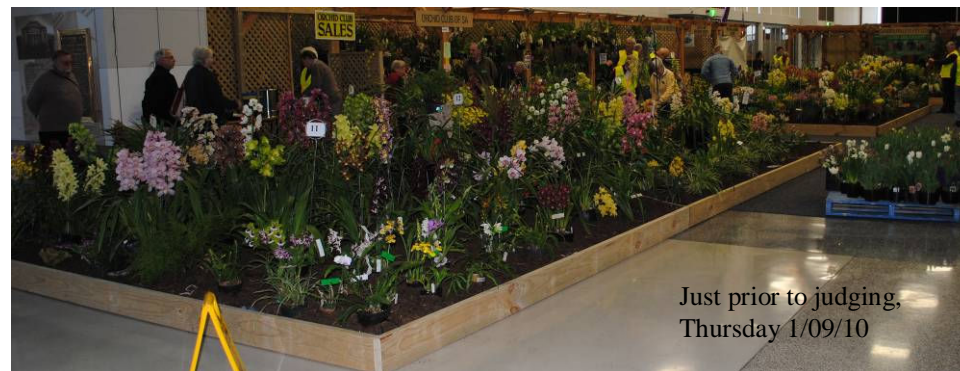
Just prior to judging, Thursday 1/09/10

Always the unknown is what area do we need for displays? How many orchids are we likely to receive? (The weather has not been great and I know that growers had orchids they had to leave at home as the flowers had not yet come out in time.)