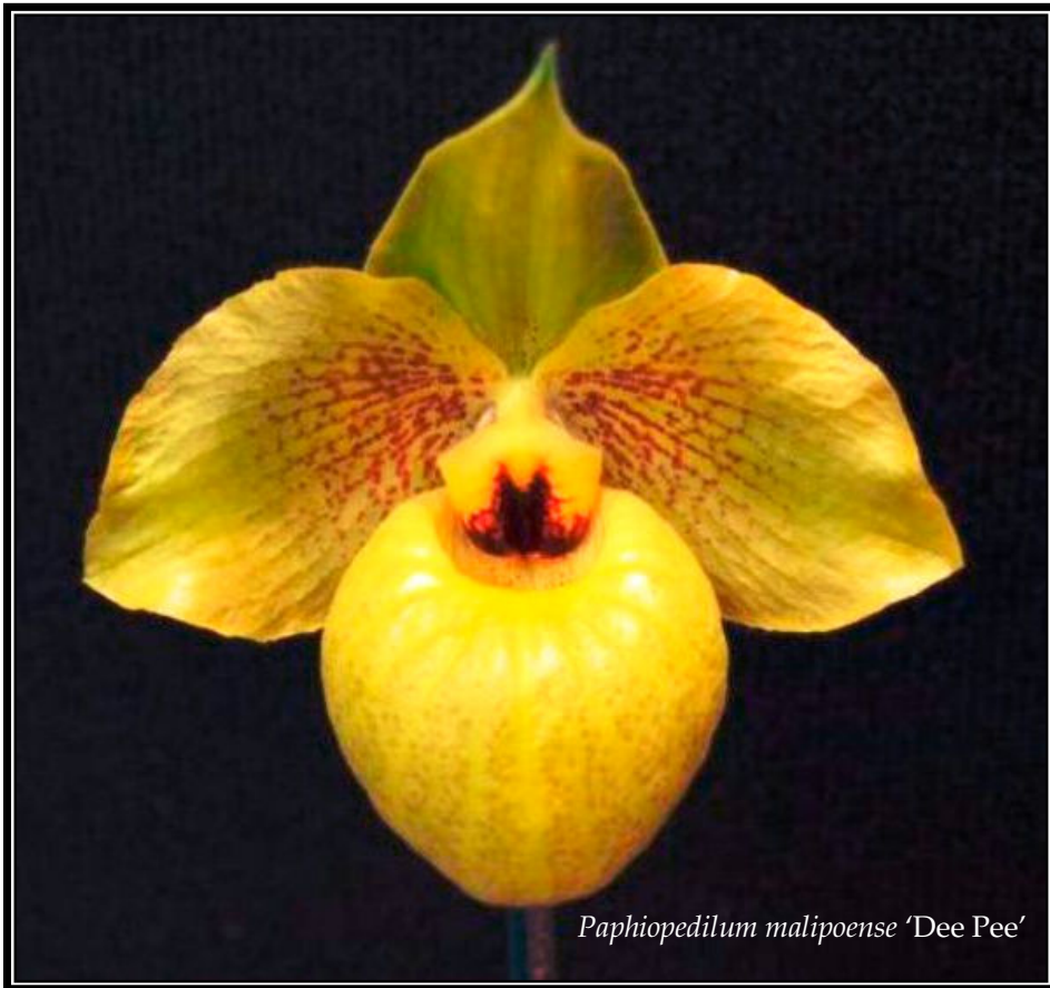
Paphiopedilum malipoense 'Dee Pee'