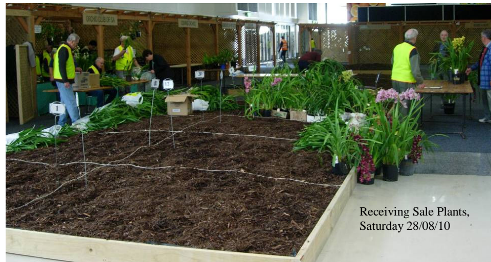
Receiving Sale Plants, Saturday 28/08/10

As part of the Royal Adelaide Show 2010, readers can understand that a lot of thinking and planning continues to go on for these events, even though we have, ‘been there’ now for 27 years. In this time we have utilized 6 different halls and pavilions at the showground.